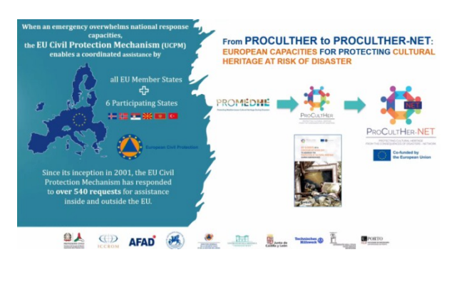
The evolution from PROCULTHER to PROCULTHER-NET in a slide

The Ministry of Culture of Italy convened, in coordination with the French Presidency of the European Union, the Conference of the Ministers of Culture of the Euro-Mediterranean region, the first Culture Ministerial meeting of the EU-Southern Partnership. The conference was hosted by the city of Naples, on 16 - 17 June 2022, and was held in hybrid format (in-presence and virtual).