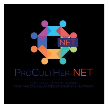
PROCULTHER-NET logo black

To establish a European thematic community, within the Union Civil Protection Knowledge Network, focused on the protection of cultural heritage at risk of disaster, gathering and involving the largest number of actors and stakeholders active in the field, through a multidisciplinary approach to enhance cooperation and to support and complement the effort made at European level.