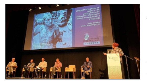
Ms Escudero talking at the Congress

In order to ensure an effective coordination system for preventing and better facing forest fires, the Junta de Castilla y León maintains active and tests periodically the protocols and collaboration agreements with border regions and with Portugal in fire emergencies, as well as with different institutions and organisations at all governance levels, e.g., MITECO, the Spanish Military Emergencies Unit - UME, town councils, provincial councils, etc.