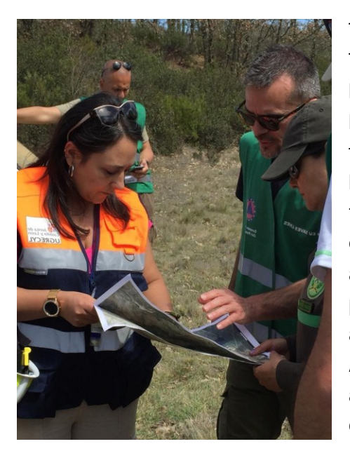
Field activities at EUMODEXLEON22

From 9 to 12 May , EUMODEXLEON22 <sup>4</sup>, an international field exercise focusing on forest fires, took place in the Autonomous Region of Castilla y León and represented another valuable opportunity to share the expected results of PROCULTHER-NET as well as to test operational procedures for the safeguard of cultural heritage in emergency.