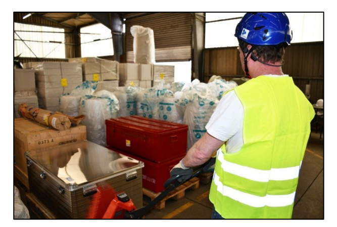
Packaging and aid materials are collected in Germany to support the protection of Ukrainian cultural heritage

In June 2022, 165 pallets of packaging and aid materials are shipped to Ukraine through the logistic network set up by KulturGutRetter (KGR), the German Archaeological Institute (DAI) and the Federal Agency for Technical Relief (THW) – both PROCULTHER-NET project partners – to protect highly endangered museums, archives, libraries and monuments.