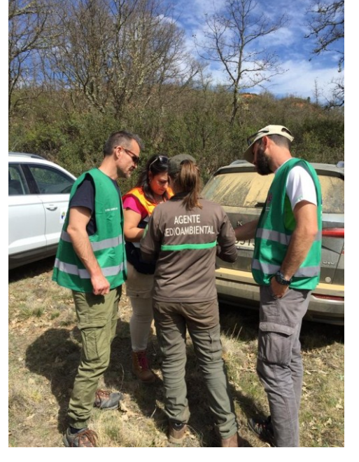
Field activities at EUMODEXLEON22

The exercise was carried out on an unprecedented scale for the Region, in an area located between the towns of Astorga and Tabuyo del Monte, in the province of León, and gathered a total of approximately 400 participants, in addition to 10 fire engines, 4 airborne resources, 4 drones and 30 light vehicles, the PMA (Advanced Command Post) and associated logistical teams. From the European Union side, 4 UCPM ground modules (2 Portuguese, 1 Greek and 1 French), 1 Italian air force module and 1 Croatian drone module joined the exercise to test procedures and interoperability of the forces displayed on the field.