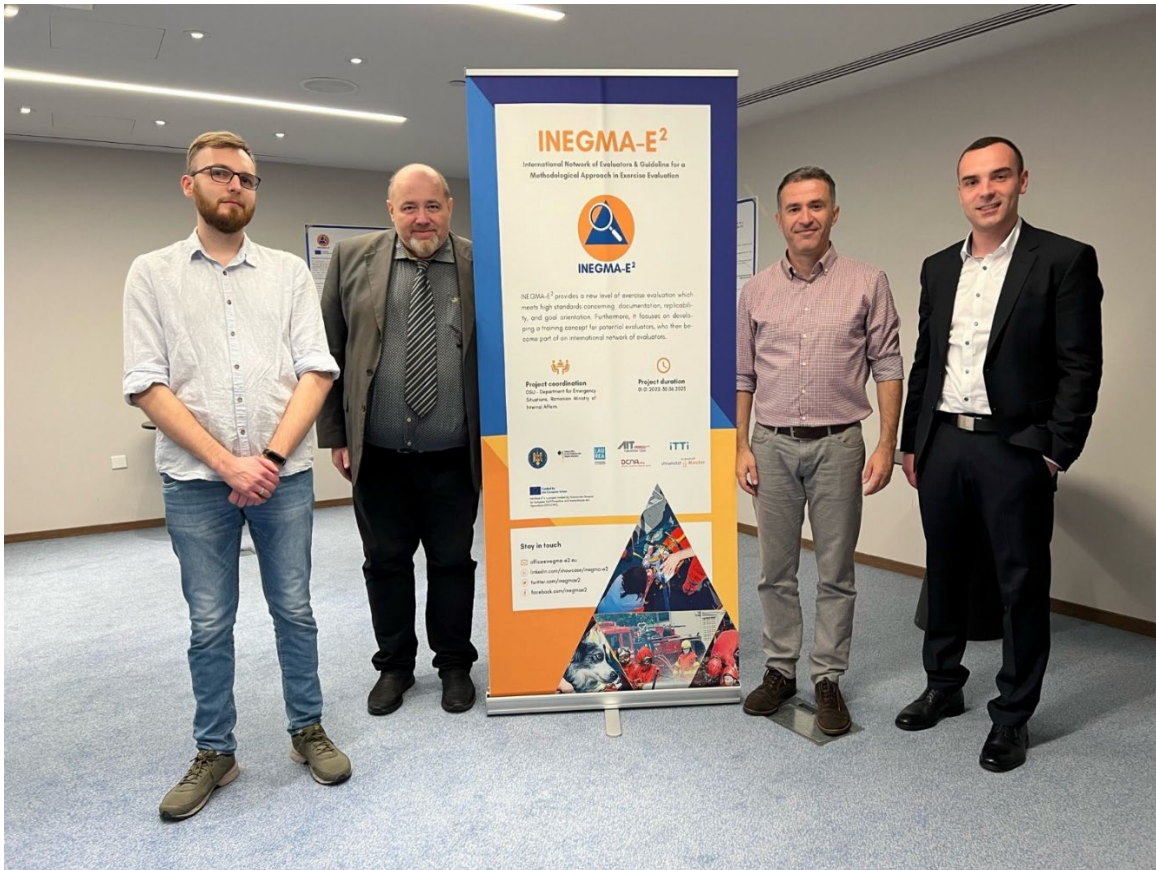
Figure 3: INEGMA-E² roll-up at Nicosia Risk Forum