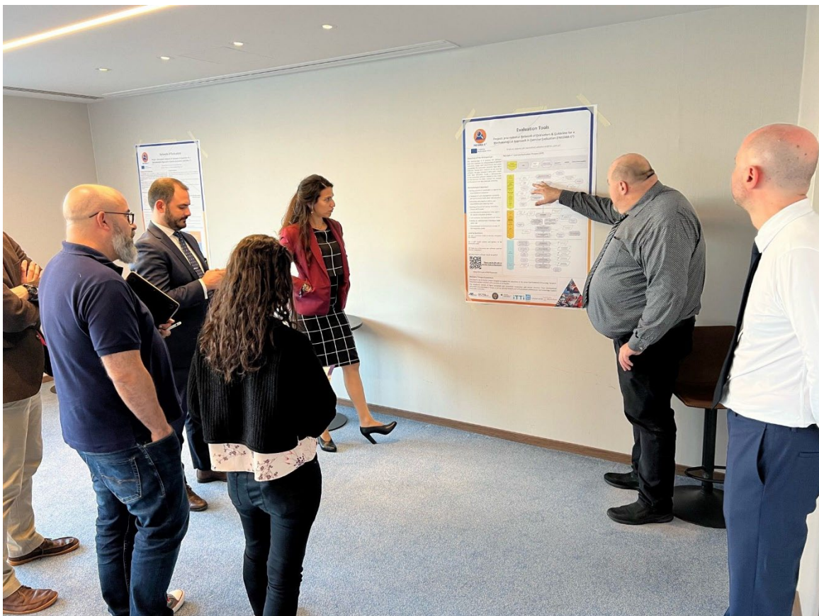
Figure 4: INEGMA-E² posters used at a workshop at Nicosia Risk Forum