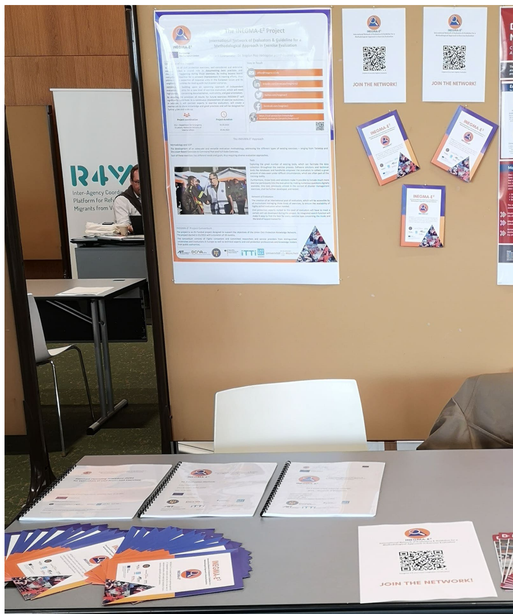
Figure 2: Presentation of INEGMA-E2 at HNPW 2023

The leaflet, roll-up as well as several INEGMA-E2 posters were used at internal and external events. The leaflet was additionally used in digital form and can also be found here: https://civil-protection-knowledge-network.europa.eu/system/files/2022-08/INEGMA-E2%20Leaflet.pdf