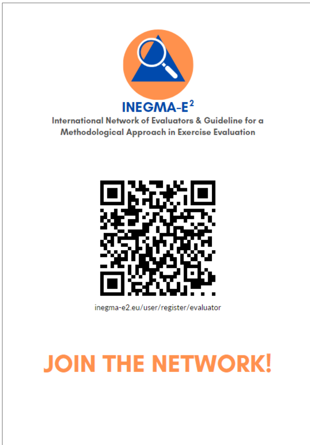
Figure 5: Flyer for registering as an evaluator in the network of evaluator

Additional materials included an A5 flyer used to promote the network of evaluators.