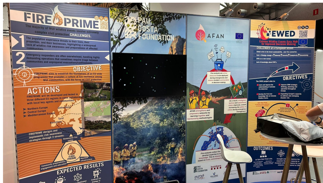
A FIREPRIME poster was displayed in the PCF's booth at 2024 ECP Forum