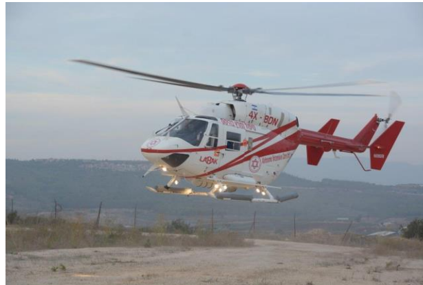
BK - 117