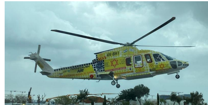
S - 76