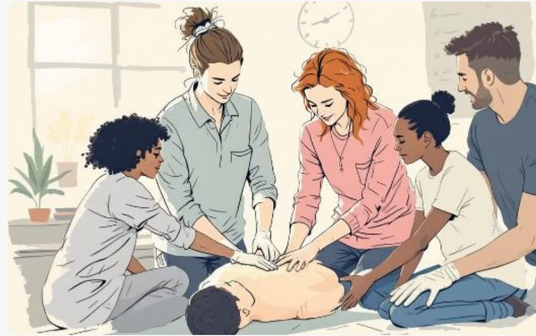
Skills Save Lives