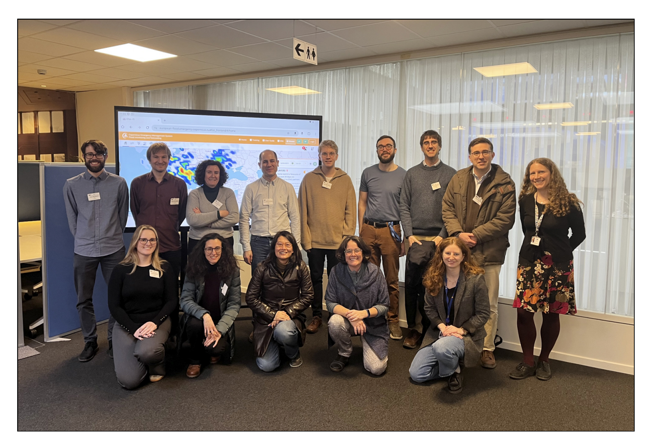
The INLINE partners met at the first project meeting in Brussels on 11-12 March 2025.

Integrated pan-European rainfall and floods Impact forecasts for cooperation in Emergency Management (INLINE) is a 2-year project funded under the call 'Knowledge for Action in Prevention and Preparedness' 2024 that aims to improve precipitation estimates, enhance storms and flash flood impact forecasts using Artificial Intelligence, and increase the adaptability of tools for multi-hazard impact forecasting.